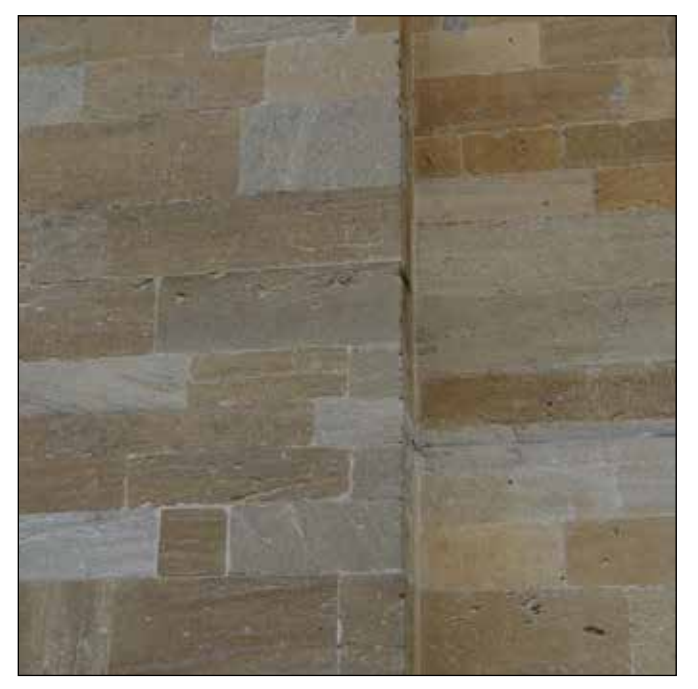
Fig. 6 Limestone ashlar 8.7 STONE SLATES

Natural stone 'slates' represent a highly important and distinctive application of the local limestone as a roofing material. Good quality stone slates were sourced from a number of local quarries in the District. Historically, however, the eponymous Stonesfield Slates have been especially highly regarded for their quality and evenness.