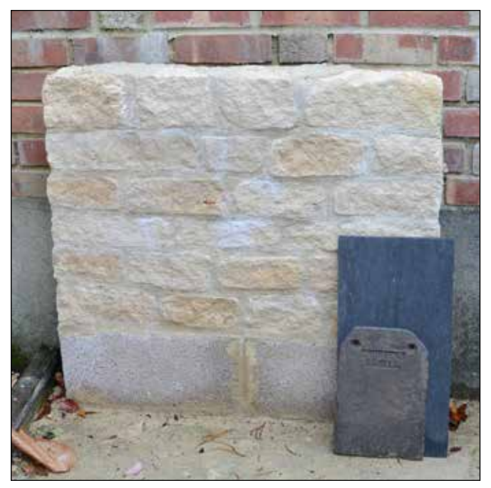
Fig. 9 Natural stone sample panel and proposed roofing materials

The sample panel must be constructed apart from, but within the context of, the development. It should be in a position on the site where it can remain until practical completion, as it will serve as the standard against which all other stonework will be assessed.