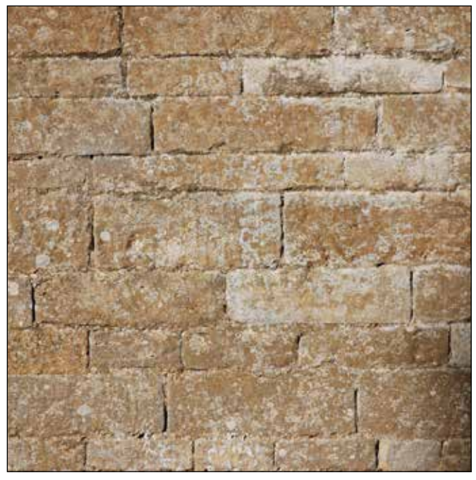
Fig. 5 Dressed stone

consistent overall appearance. The greater uniformity allowed for narrower mortar beds between courses, and a flatter and more even overall appearance to the stonework. This finish is characteristic of the District's C18 and C19 vernacular houses, and in particular higher status detached properties of this period.