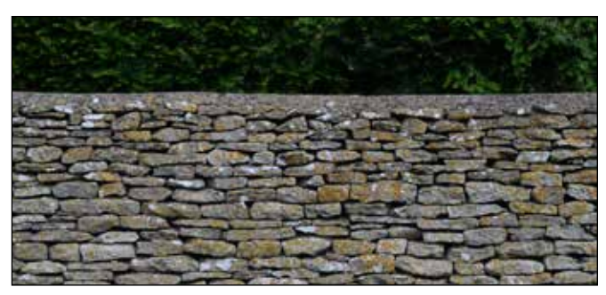
Fig. 2 Random upright coping (top); flat stone coping (middle); curved mortar coping (bottom)