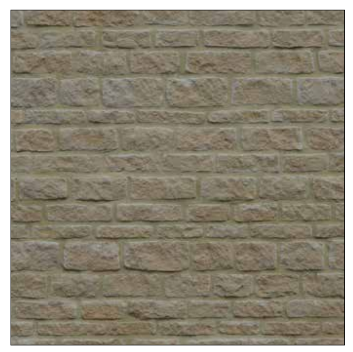
Fig. 8 Artificial stone wall

The purpose of artificial stone is to replicate the character and appearance – and specifically the colour and texture – of local natural stone. Artificial stone is available in 100mm thicknesses, to allow the formation of an outer skin. In order to give the most natural appearance possible, artificial stone should be employed in a wide range of course heights and stone lengths.