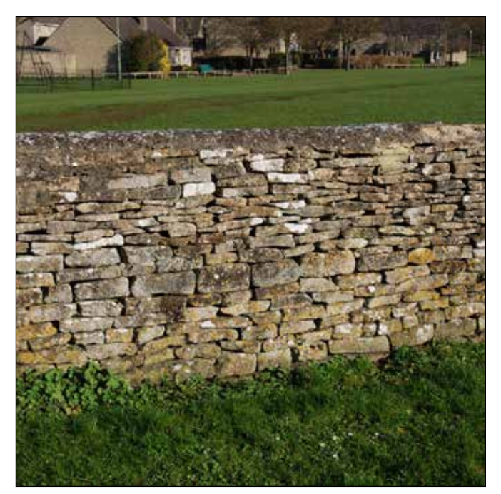
Fig. I Traditional dry stone wall

Locally quarried stone – most notably the distinctive pale or buff-coloured oolitic limestone – is a defining feature of the built character of West Oxfordshire, employed both as a walling stone and for roof slates. In the far north of the District (and reflecting a change in the underlying geology here) distinctive orangey, brown or rustcoloured ironstones are also found.