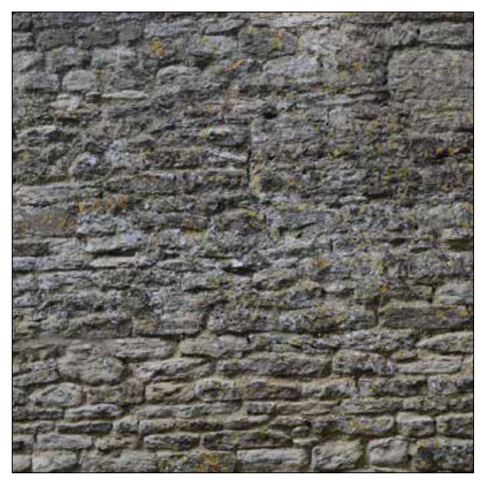
Fig. 4 Traditional rubble stone wall

This finish is a characteristic of the District's field and property boundary walls, with the stones generally laid dry; and of many of the District's vernacular houses and cottages, laid with lime mortar – particularly those belonging to the C17 and C18.