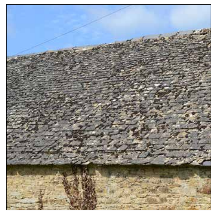
Fig. 7 Natural limestone stone slates

This roofing material is especially characteristic of local vernacular houses, cottages and agricultural buildings of the C17 and C18 and remains a conspicuous and precious feature of both Listed and non-designated buildings throughout the District (frequently being highlighted in List entries in the case of the former).