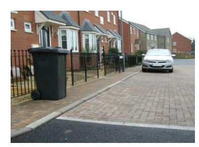
Pavers must be able to withstand the weight of collection vehicles; drop kerbs assist the movement of bins