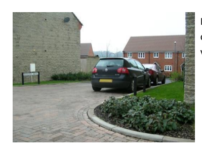
Parked cars can cause an obstruction to waste collection vehicles entering roads

To enable collection crews to manoeuvre bins and other waste containers safely back and forth from the collection vehicle and to reduce accidents associated with trips/falls and manual handling, surfaces between the highway and the waste collection point need to be even and free from steps.