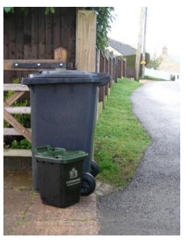
Containers presented correctly at the curtilage to a property

Developers may wish to consider bin store areas as part of their plans and the council's contractor will collect waste or recycling from designated stores so long as there is adequate access to enable this to be done safely and the storage area itself isn't more than 10 metres from where the collection vehicle can safely park to make the collection. Where bin stores are not accessible, residents must take their waste to the nearest adopted highway.