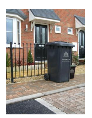
Containers presented correctly at the kerbside

It should be noted that West Oxfordshire District Council operates a 'no side waste policy.' This means our contractor will only collect refuse presented in a wheeled -bin as outlined above with the lid fully closed. Therefore communal bin stores must provide enough space to house the appropriate number of bins for the number of dwellings it is designed to serve.