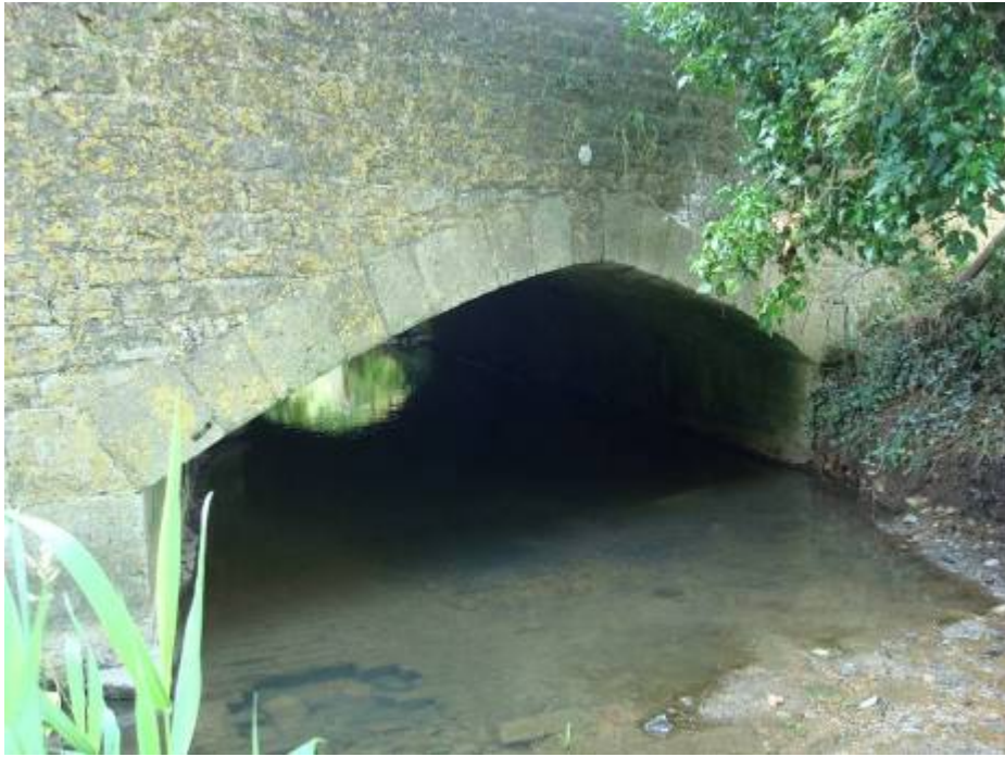
Photo 16 – Chil Brook at Station Road Bridge looking upstream from the bridge