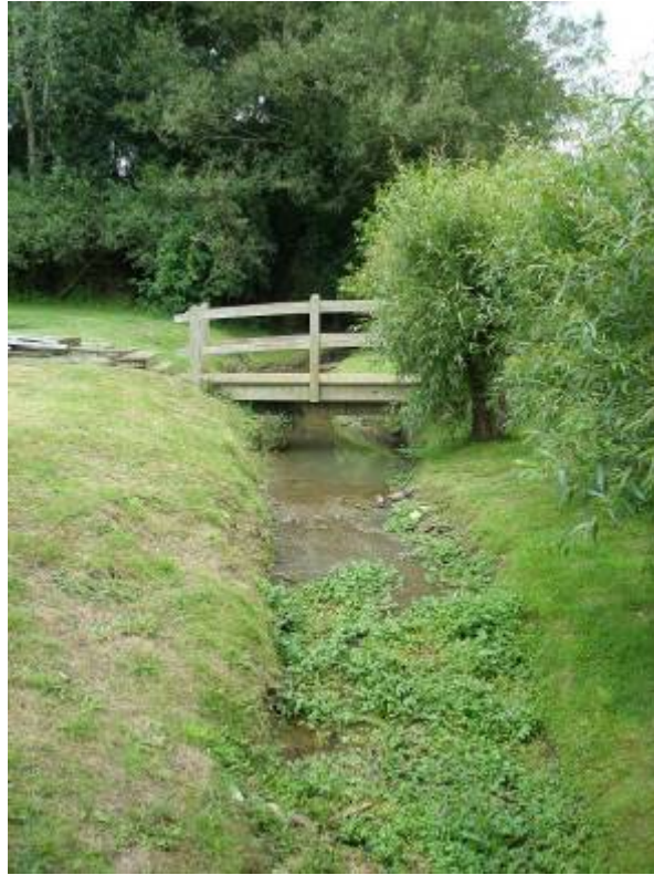
Photo 2 – Field drainage entering a pipe at the rear of properties on Barnard Gate