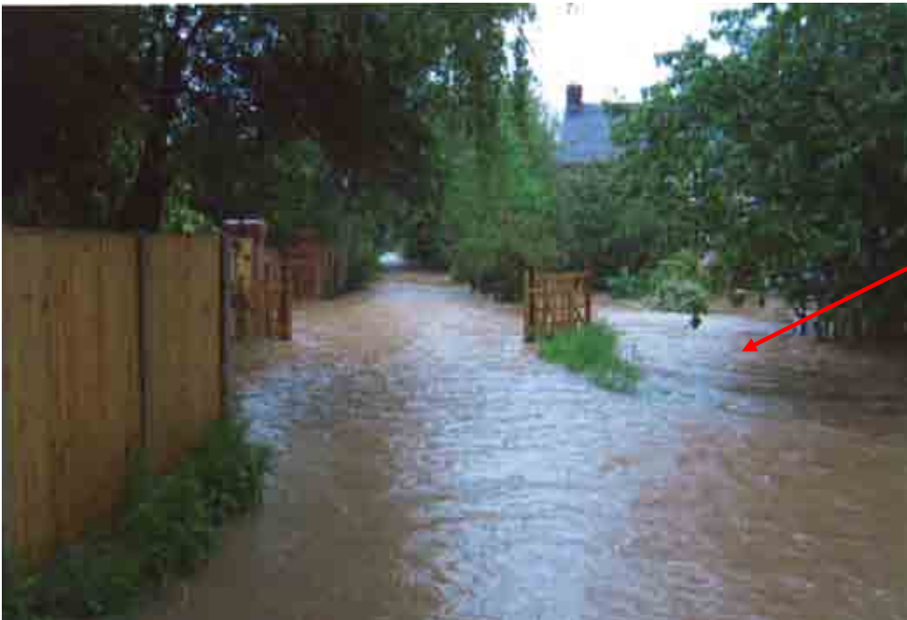
Photo 5 – Chil Brook in flood 3rd June 2008 . Photo is looking upstream at Barnard Gate with the old A40 behind