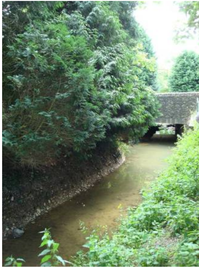
Photo 10 – Old A40 road bridge 3rd June 2008 . Note the flood level of this event was lower than that of June 2007.