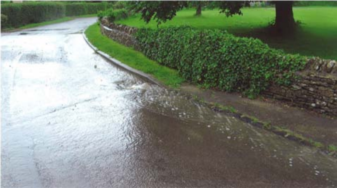
Photograph 9: Water flowing down Park Road from Alma Grove to Post Office