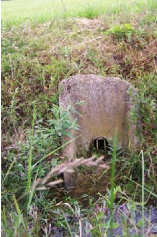
Photograph 13: Outlet from field ditch at rear of property on Park Road at Alma Grove. Drainage connects to highway drainage system on Park Road.