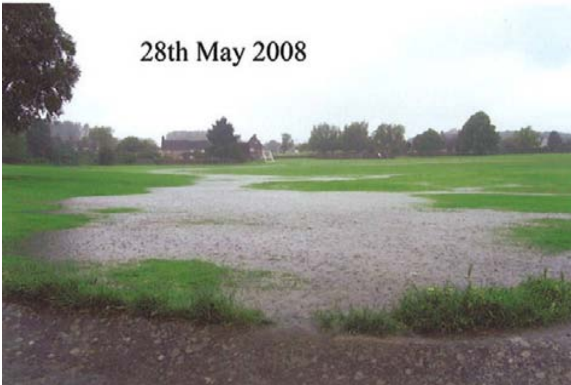
Photograph 6: Flooding at skating bowl at the bottom of the recreational field