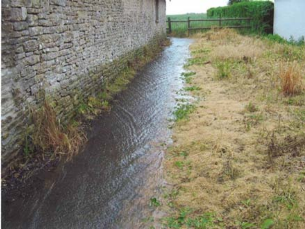
Photograph 15: Water flowing from farmland at the rear of Alma Grove towards Park Road