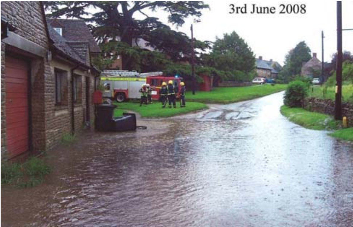
Photograph 2: Flow path of flood waters through driveway from Park Road to the Recreation Ground. 3 rd June 2008