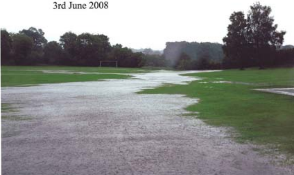
Photograph 4: Flooding in recreation field