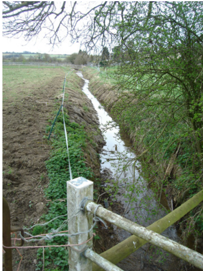
Upstream of the Priory Lane culvert March 2009