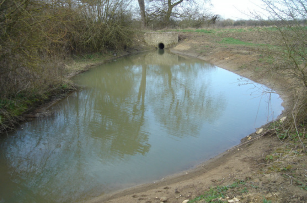
Photograph of the pond near the golf course; last cleared March 2010