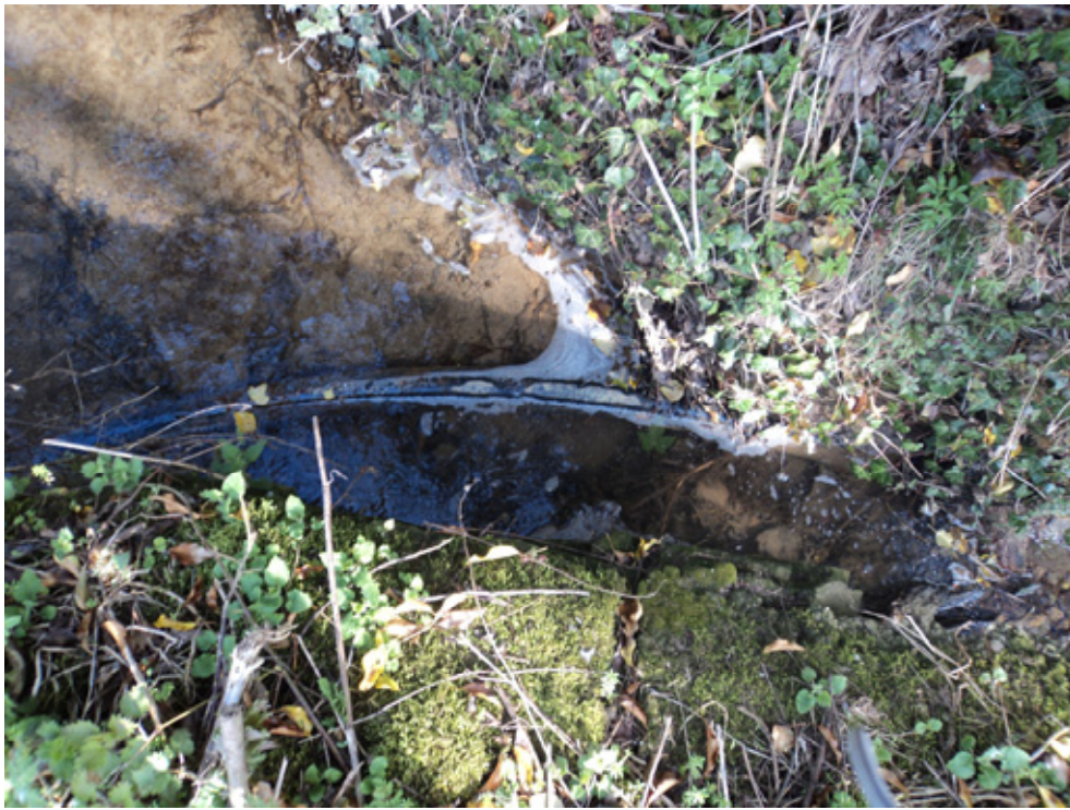
Existing services pipe from Maricote obstructing ditch