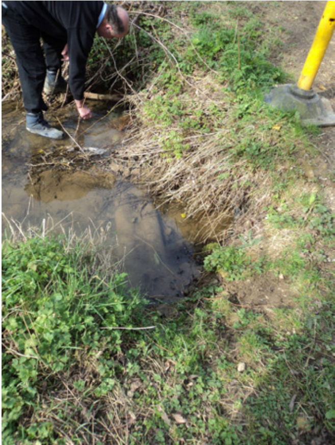
Existing southern electric pipe obstructing flow of ditch