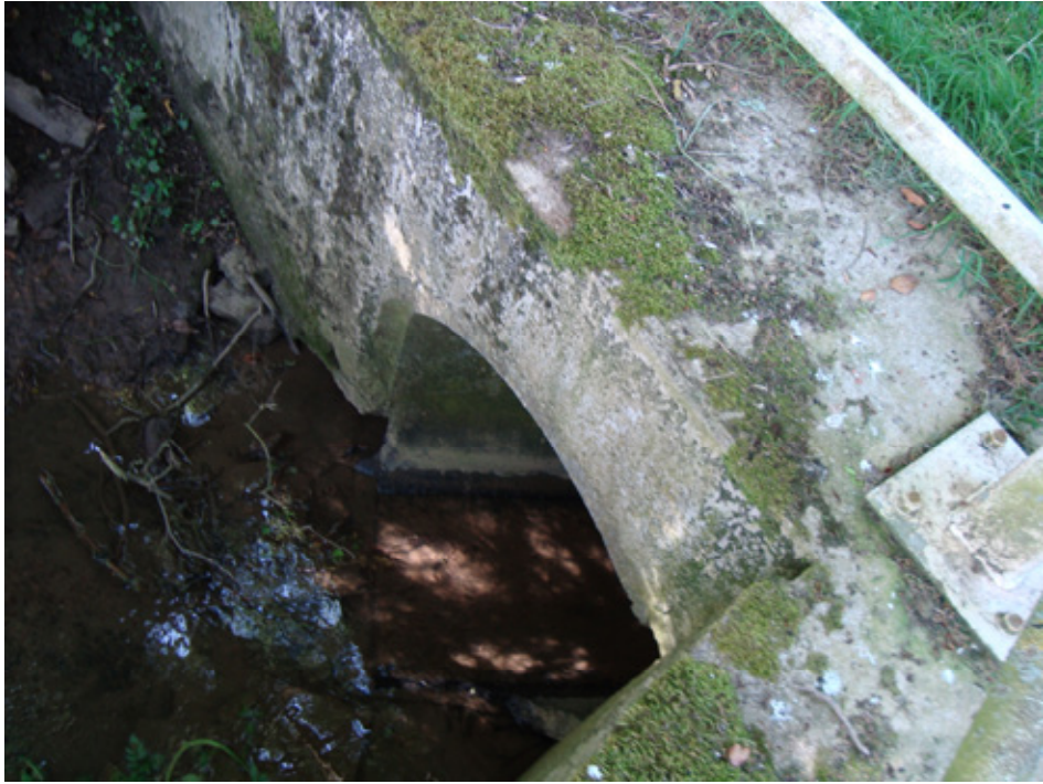
Priory Lane culvert June 2009