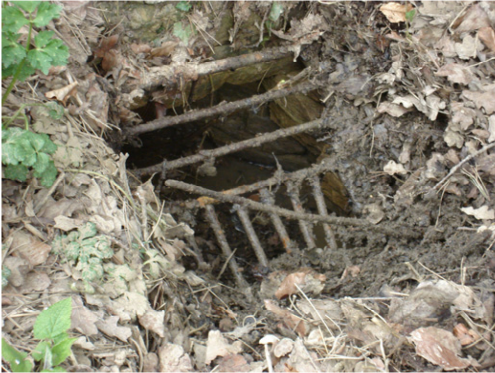
Culvert grid at The Leys, Lyneham March 2009