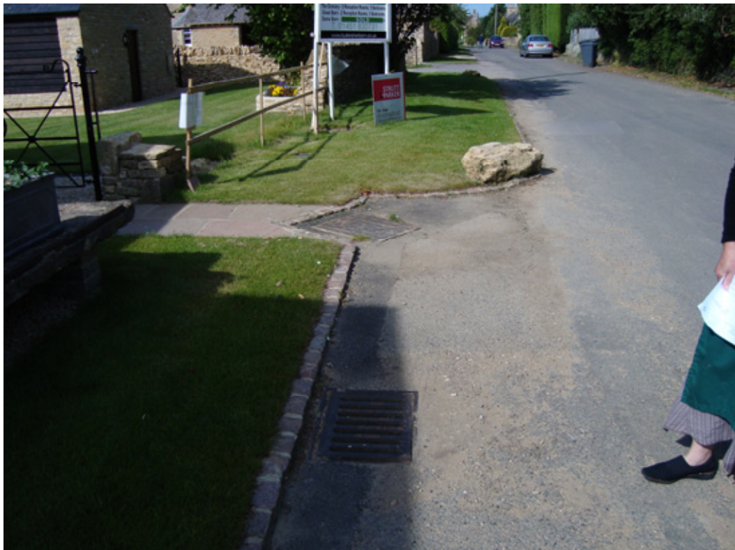
Highway drainage on High Street, Lyneham