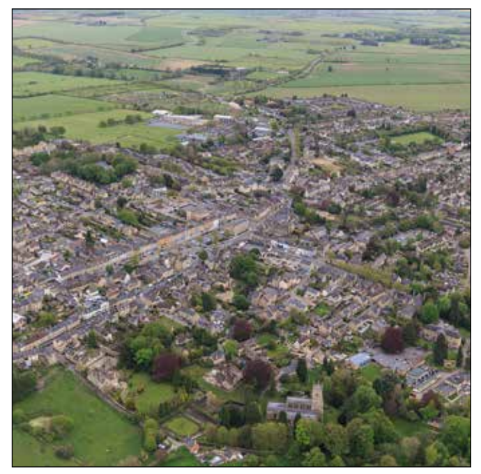
Fig. I Aerial view of Chipping Norton

A thorough analysis of the site and context should not only underpin every development proposal, but aspects of the analysis should be submitted as part of any subsequent planning applications, in order to demonstrate a clear understanding of the site and context, and to provide meaningful justification for the final design solution.